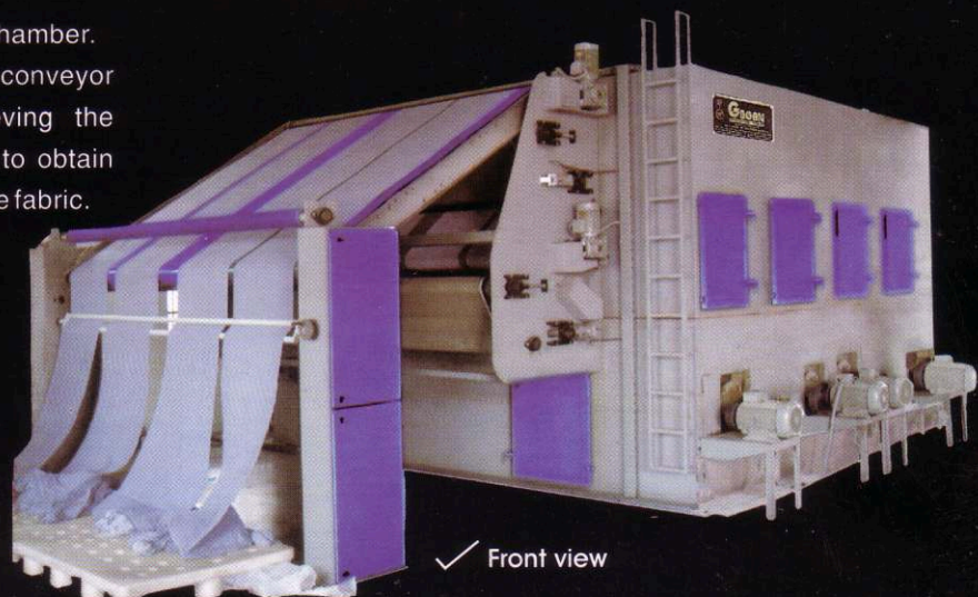
✓ Front view